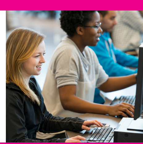
Flexible study course between 5-21 February 2021