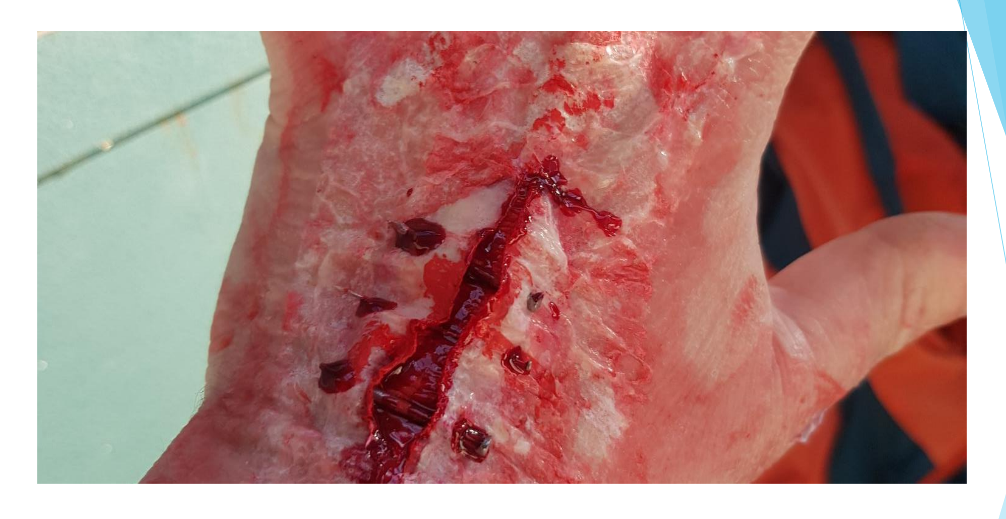
Graphic hand injury: latex, tissue, paint, nails and fake blood.

One of the processes covered in the after-school workshops.