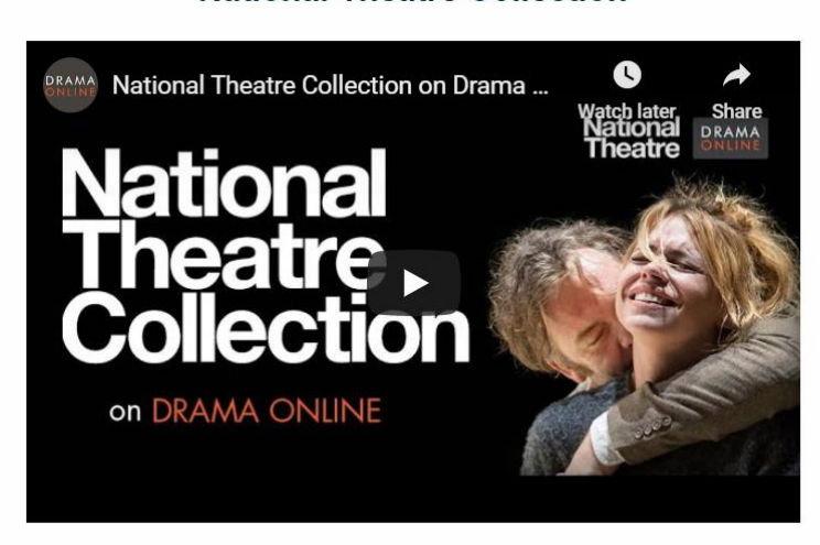
Explore the collection

Please note the free access is only to the National Theatre Collection, not the whole of Drama Online.